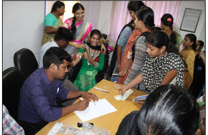
A snap from the Thyroid camp