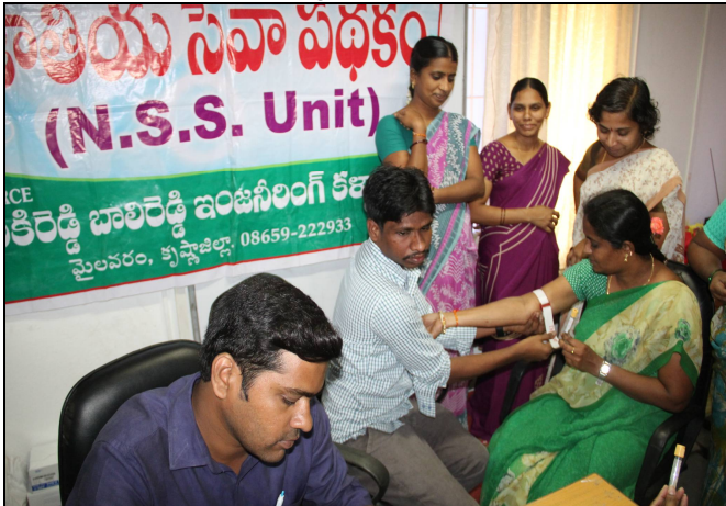
The Thyroid camp in progress