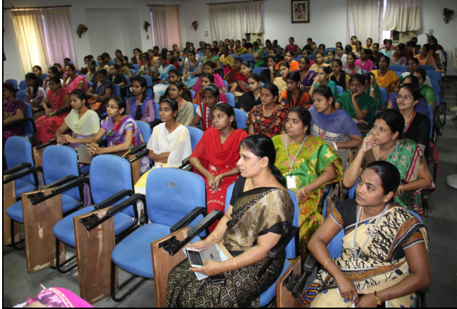
Attendees of the program