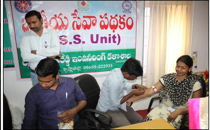
NSS Programme officer supervising the camp